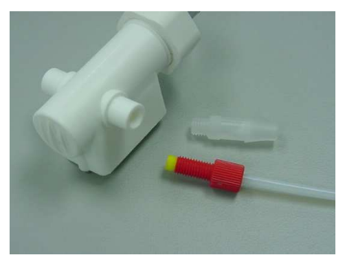
Example of 1/4-28 UNF bottom sealing fitting (bottom) and face sealing fitting (top)