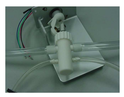
Example of pump with rinse ports at rear of pump (note: hose clamps have been removed for photo clarity).